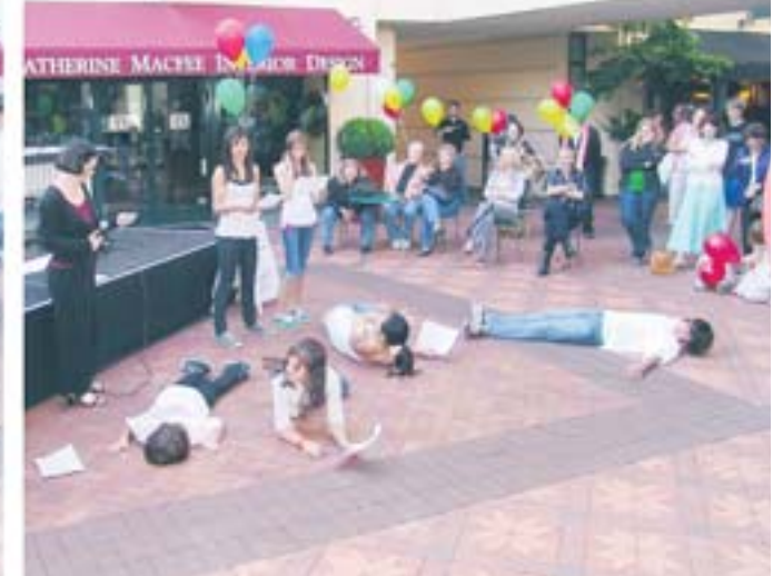
OIS students win a speed performance contest against Chamber of Commerce and City Council Members

ith the launch of California Shakespeare Theater's 35th season last week, summer has officially begun in Orinda. Over 100 people gathered in Theater Square for the 3rd annual Orinda