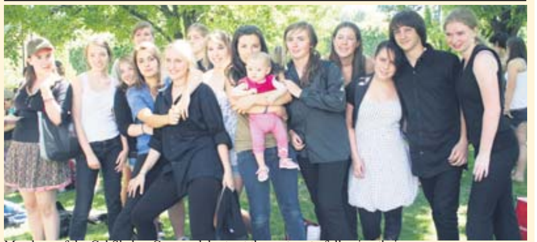
Members of the Cal Shakes Camp celebrate at the cast party following their production of Henry the IV, Part I.