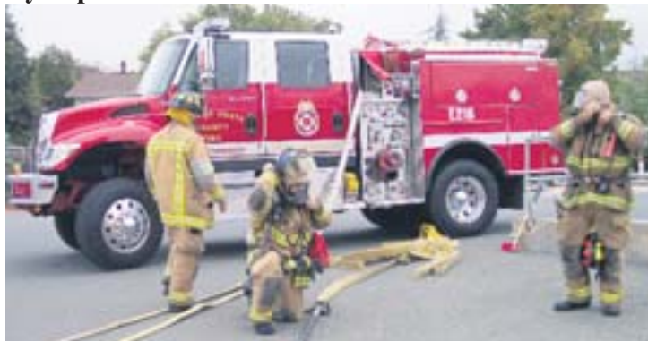
Vehicle and personnel from Contra Costa County Fire

On August 1, from 10:00 a.m. to 2:00 p.m., the Lafayette Safety Fair will take place at Stanley Middle School, 3455 School St. The Safety Fair is brought to you by the Lafayette Police Department, Lafayette Emergency Preparedness Commission and the Lafayette Crime Prevention Commission.