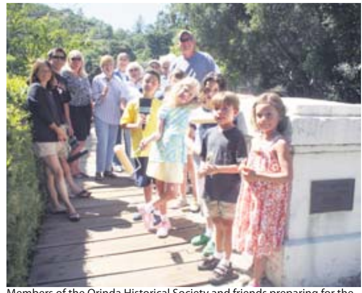
Members of the Orinda Historical Society and friends preparing for the bridge restoration on Saturday, August 1st.