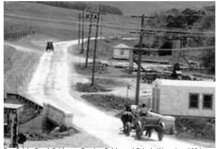
San Pablo Creek Bridge at Camino Pablo and Orinda Way, circa 1924.

History takes time. History makes memory... Gertrude Stein