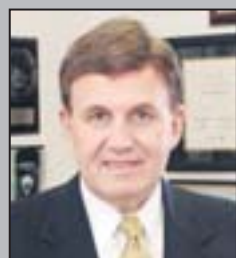
#1 Agent & Top Producer Orinda Office - 2008