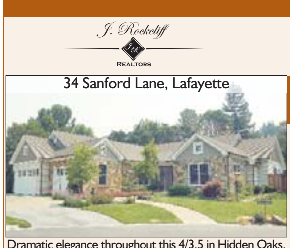
Dramatic elegance throughout this 4/3.5 in Hidden Oaks. Level yard, light & bright, 3 yrs new. Now $2,495,000