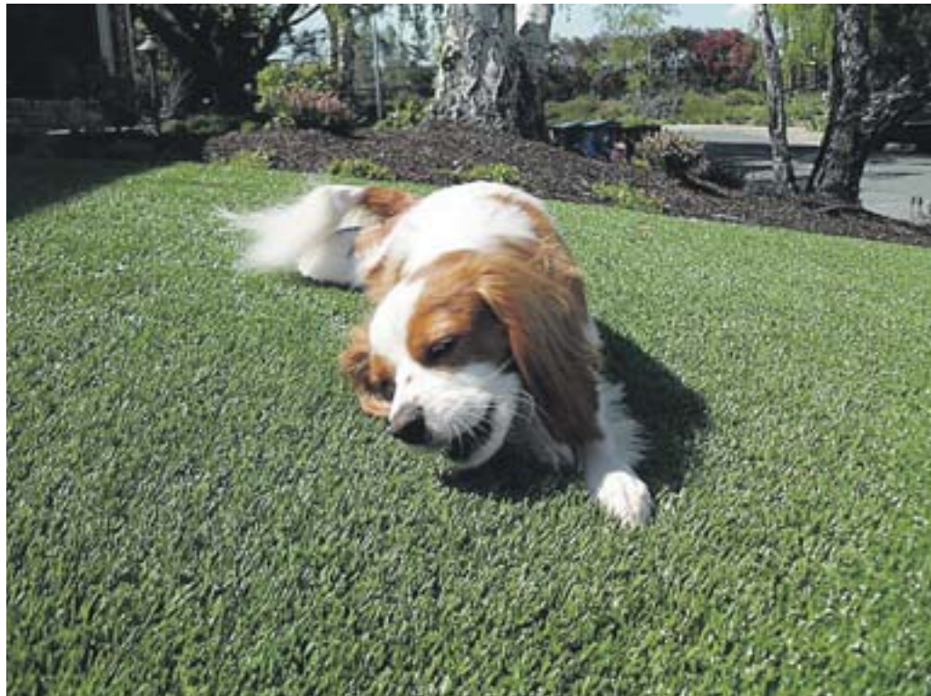
A puppy enjoying his brand new synthetic grass