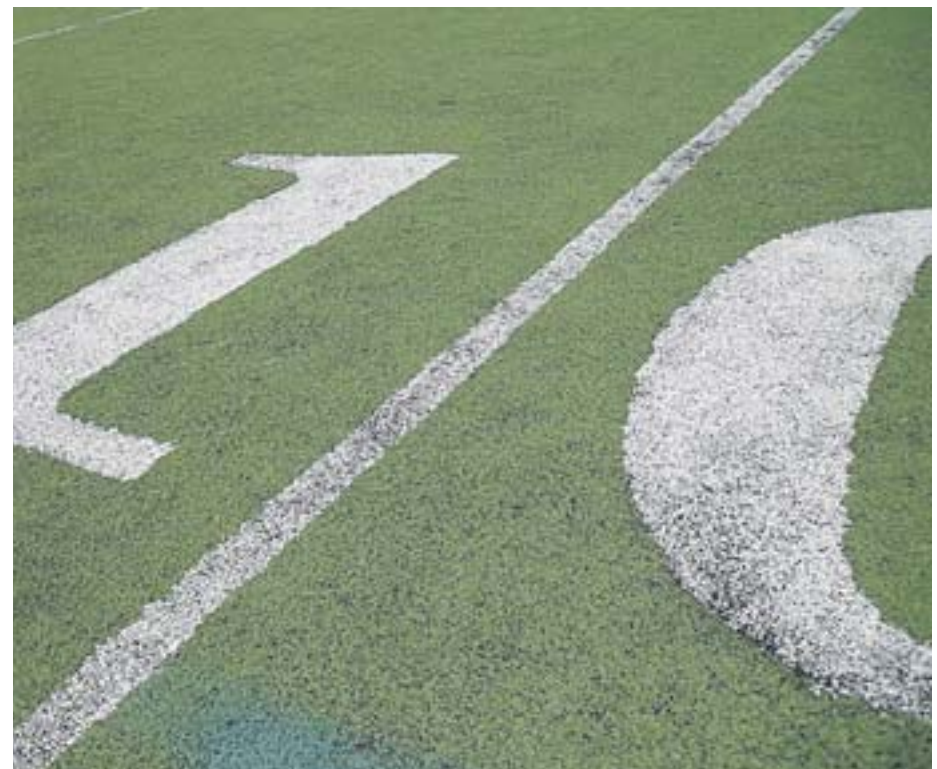
Synthetic grass has been installed at Miramonte playing fields