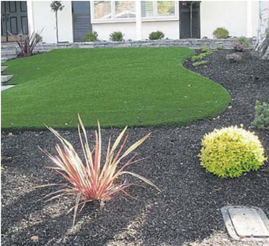
Front yard with synthetic grass