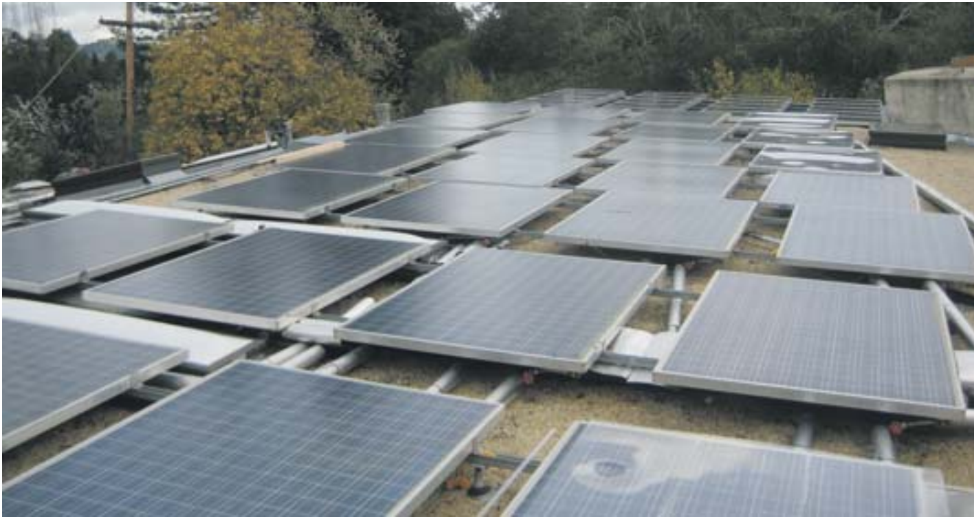
Roof-mounted solar panel