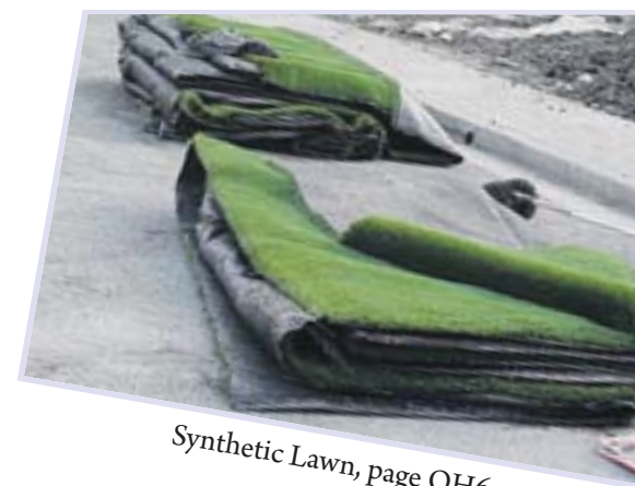
Synthetic Lawn, page OH6