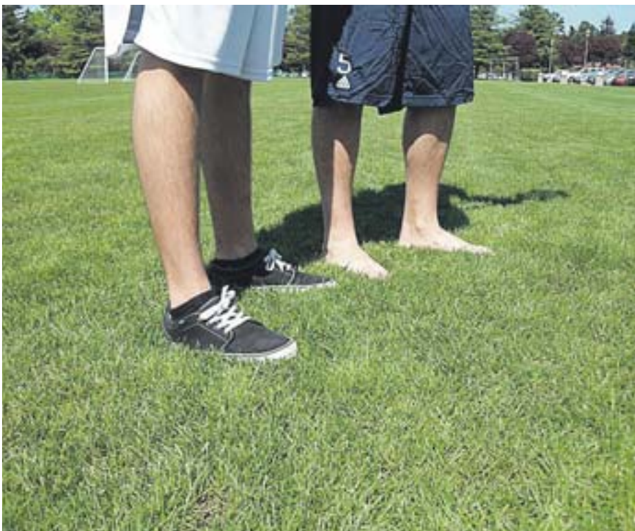
Real grass still tickles feet at Saint Mary's College

For more information call Orchard Nursery at (925) 284-4474 or PaverPro at (888) 883-8184.