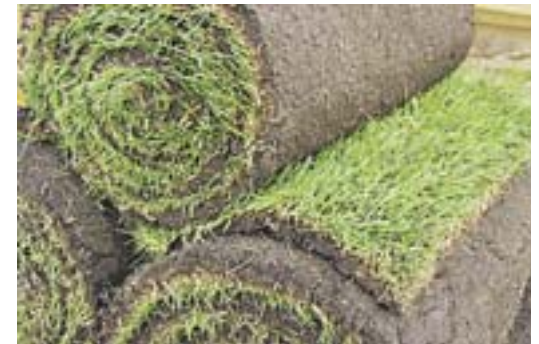
Real grass ready for installation