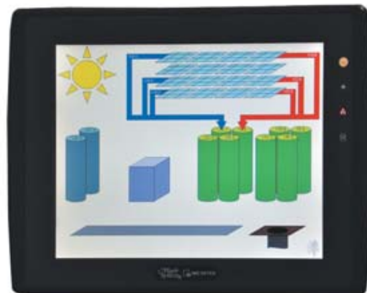
Control panel for water heating