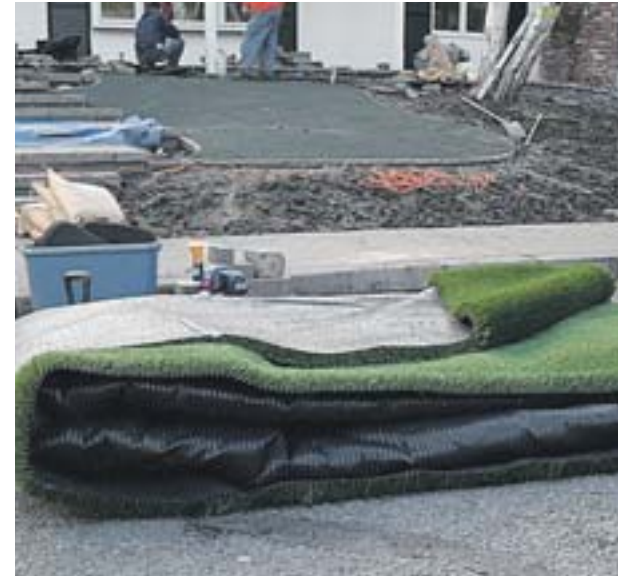
Plastic grass ready for installation