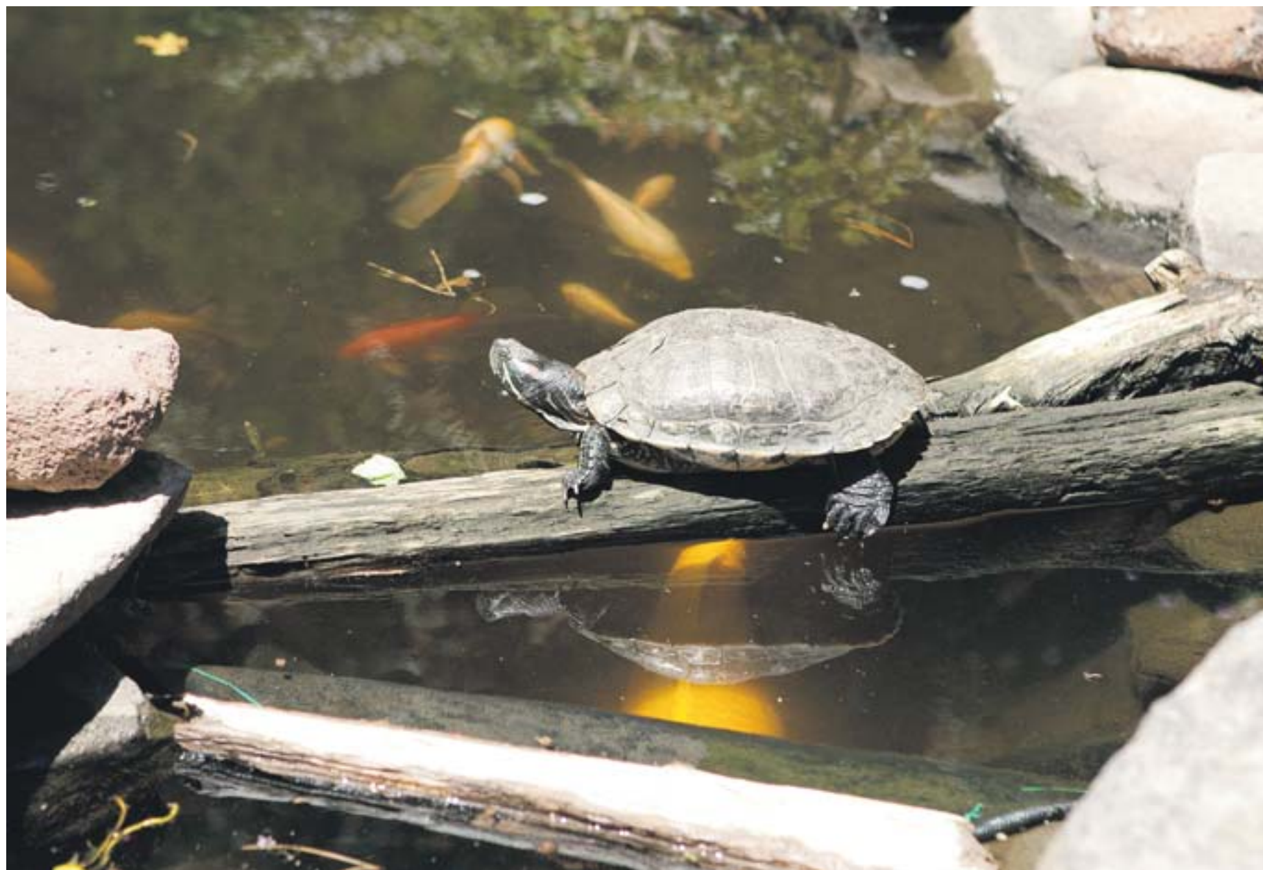
Turtles, goldfish and koi inhabit Al Kyte's pond in Moraga

"When we have guests, they always sit on the coping of the pond," says Kohen, "and they play with the fish."