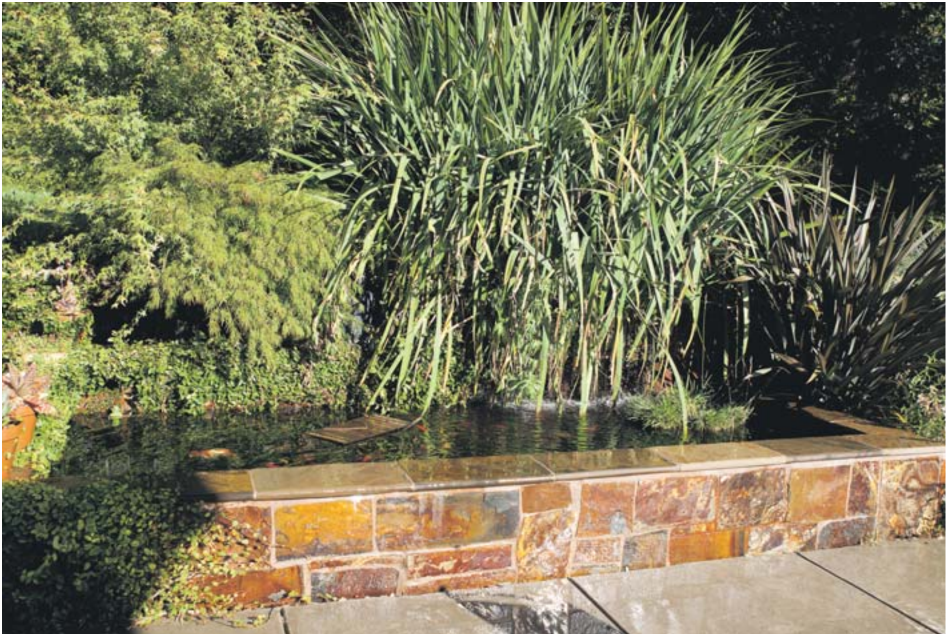
The Kohens' rectangular pond, full of goldfish and koi, is the focal point of the patio