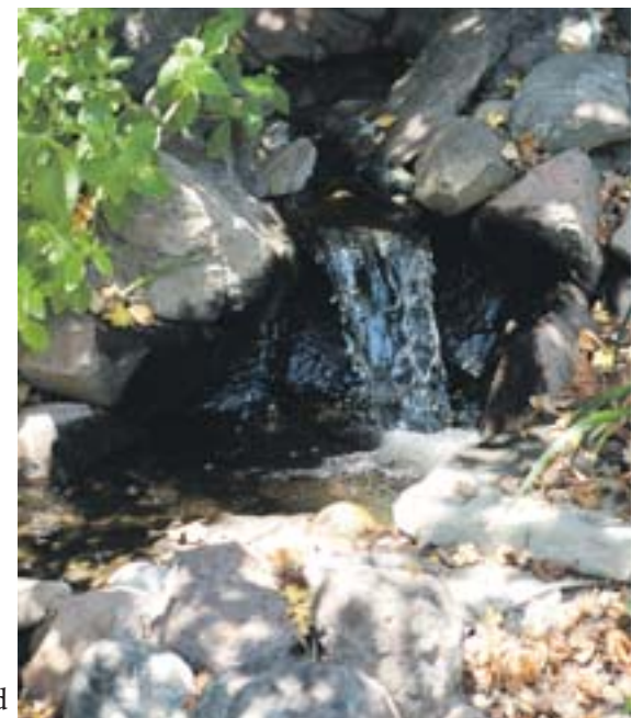
One of the waterfall features of Al Kyte's pond

The last aspect of these attractive features is their price. "I would say that the price range is between $7,500 and $15,000," said Lambert, but there is no upper limit. For example, a few years ago Lambert created a "swimming pond" in Lafayette, a self-sustaining system large and clear enough to swim in. The biggest water feature he worked on covered many acres, which sounds more like a little artificial lake than an average family home pond.