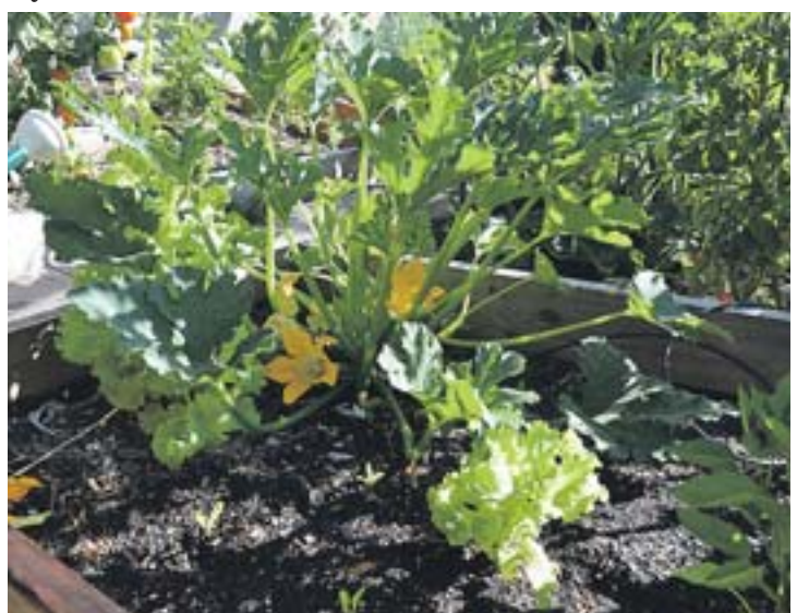
Zucchini flowers in the early morning

Zucchini is actually rather nice