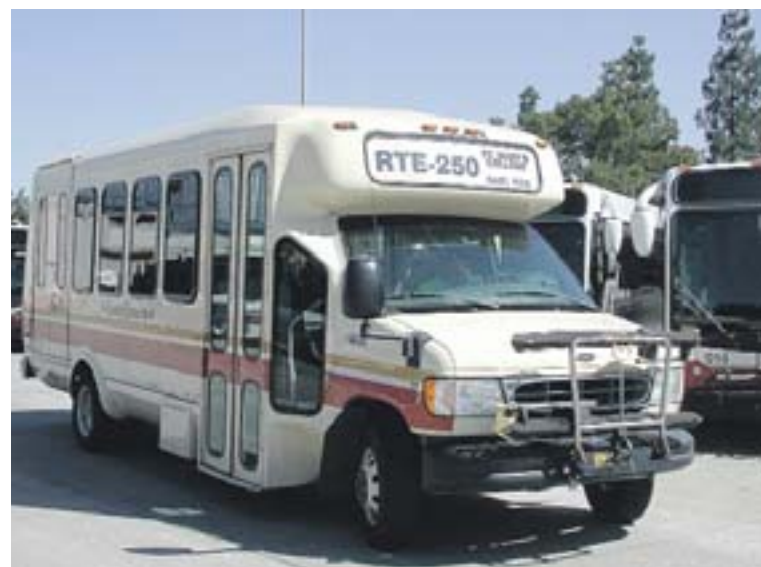
The Gael Rail waits for customers at the BART station.

The Gael Rail is returning to Lamorinda. The shuttle will run from 9:30 p.m. to 12:45 a.m. on Thursday and Friday, and on Saturday and Sunday from 6:30 p.m. to 1:25 a.m. between the Lafayette BART station and the Saint Mary's campus. Students travel free and a new service has been added – the shuttle will stop at Ascot Drive on request.