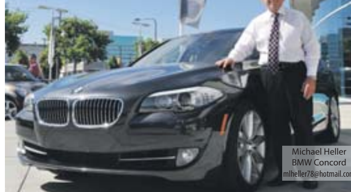
Michael Heller BMW Concord | 1967 Market ST. | Concord