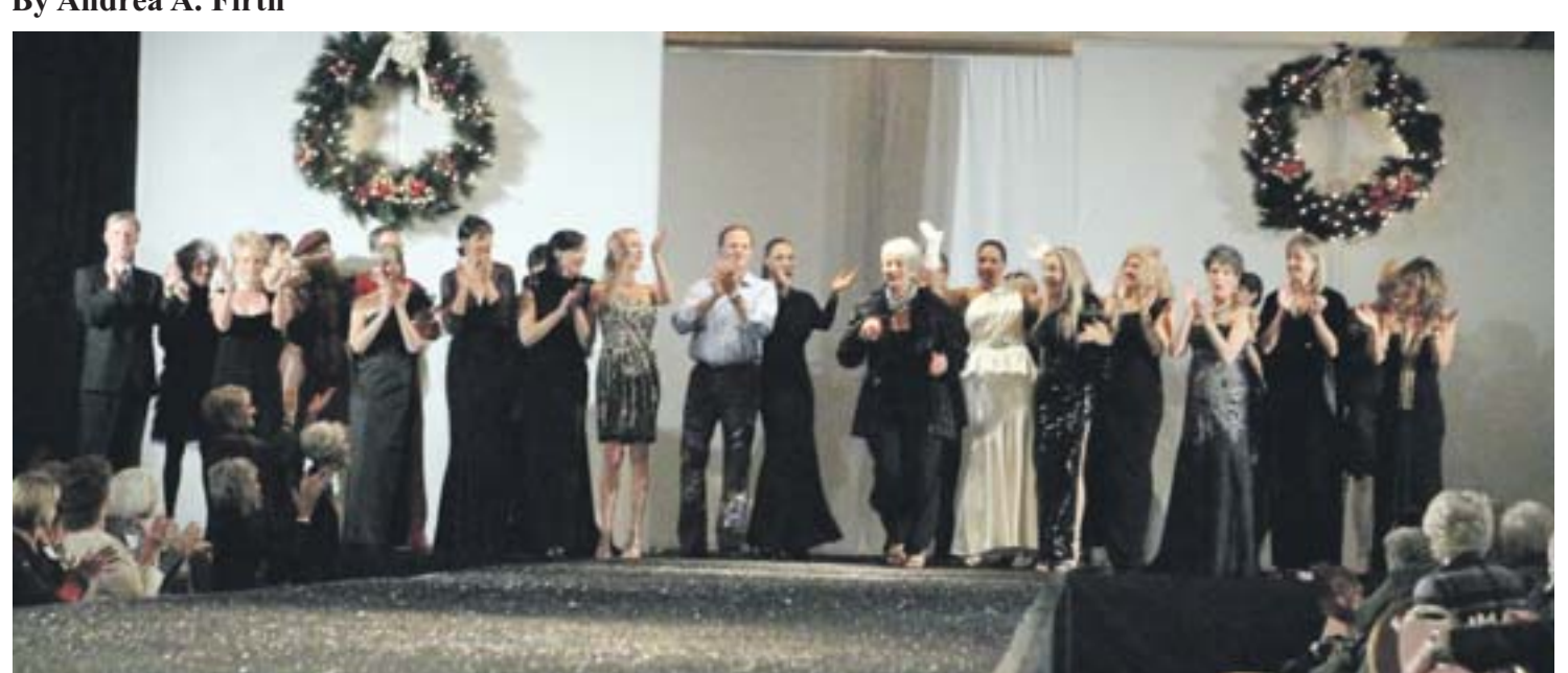
The Orinda Woman's Club 24th annual Festival Of Trees included lunch for 500 and a fashion show.

lmost 500 women attended the Orinda Woman's Club (OWC) 24th annual Festival of Trees event held at the San Ramon Marriot on November 18th.