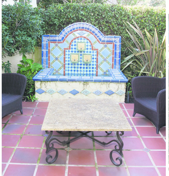
The Delaplanes' front courtyard