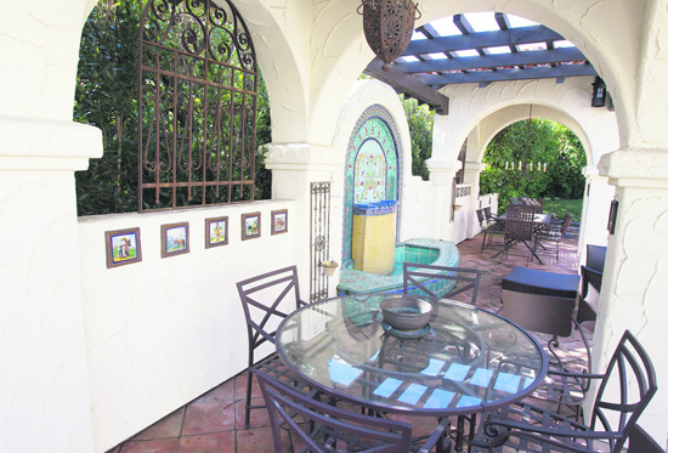
The courtyards in the Delaplane home are enhanced by beautiful tiles.

"For inspiration I looked to the Spanish Colonial Revival architecture designed and built in Santa Barbara, and the early California Missions" says Deakins, "all the windows are trimmed with redwood; the green painting will match the copper of the gutters as it ages. I've chosen a lighter color palette throughout and used hand made material in the construction, such as the Hispano-American terra-cotta tiles covering the front steps or the hand-cut Southwest flagstone fireplace." The 4,000 square foot home perched on a hillside, with a partial second floor, is a modern interpretation of the Spanish style; with a more compact floor plan. The materials, such as the inside wall treatment made of naturally pigmented and textured plaster, bring out the Spanish revival accent.