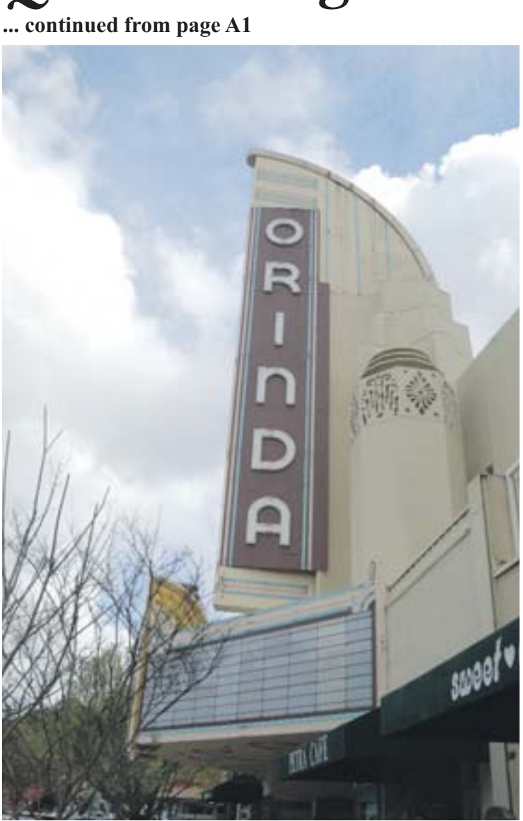
The theater's marquee went blank last Thursday