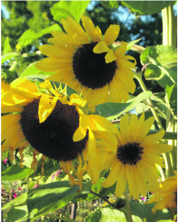
Sunflowers are the perfect flower for the graduate as they shout "Congratulations!"