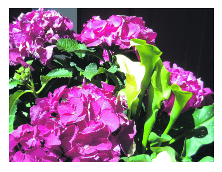
A boastful message of magnificent beauty and heartlessness with the magenta hydrangea and white calla lily.

Gallantry, happiness, purity, fidelity, and marriage were the unspoken words voiced from the shield-shaped bouquet of Kate Middleton as she wed Prince William at Westminster Abbey. The ivy symbolized marriage, the myrtle fidelity, lily-of-the-valley was happiness and purity, and sweet William meant gallantry, a quite fitting combination for a royal roundup.