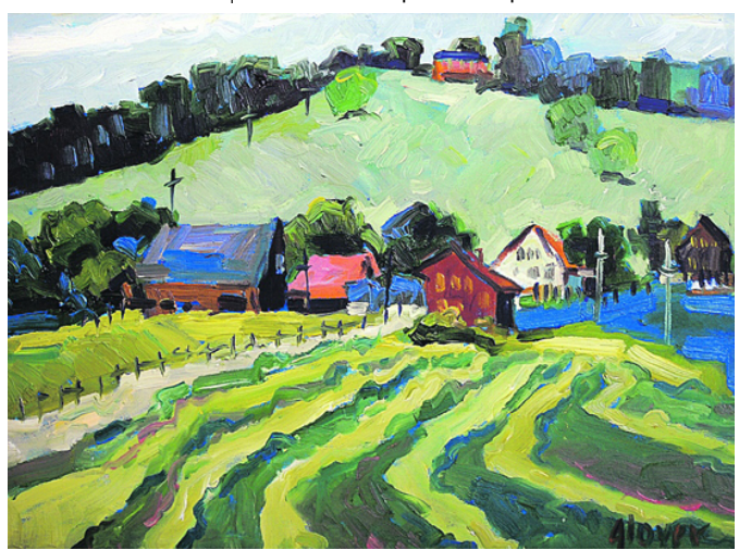
Pam Glover, Town on Hill Images provided