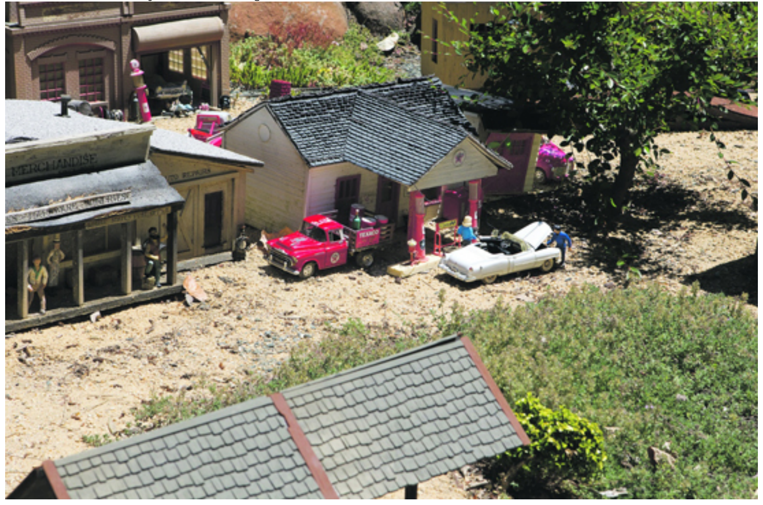
file:///C|/Documents%20and%20Settings/Andy/My%2...issue0510/pdf/Gathering-Round-the-Railroad.html (2 of 4) [7/18/2011 5:55:00 PM]