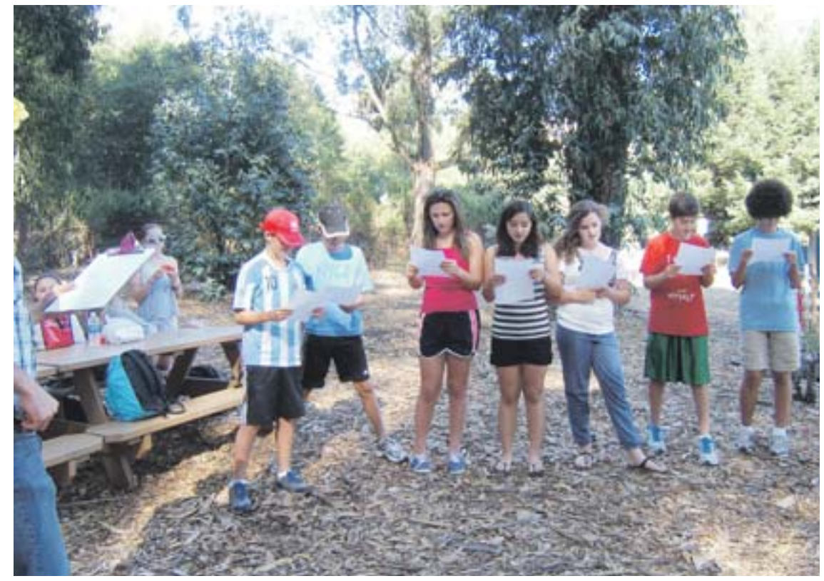
JM students present "30-second Shakespeare" (a very abbreviated version of Taming of the Shrew), directed by Cal Shakes educational staff, before the show.

With this information, the stuseek: proper motivation.