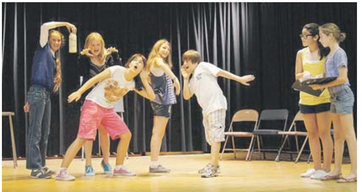
The Wednesday cast rehearses for A Midsummer Night's Dream