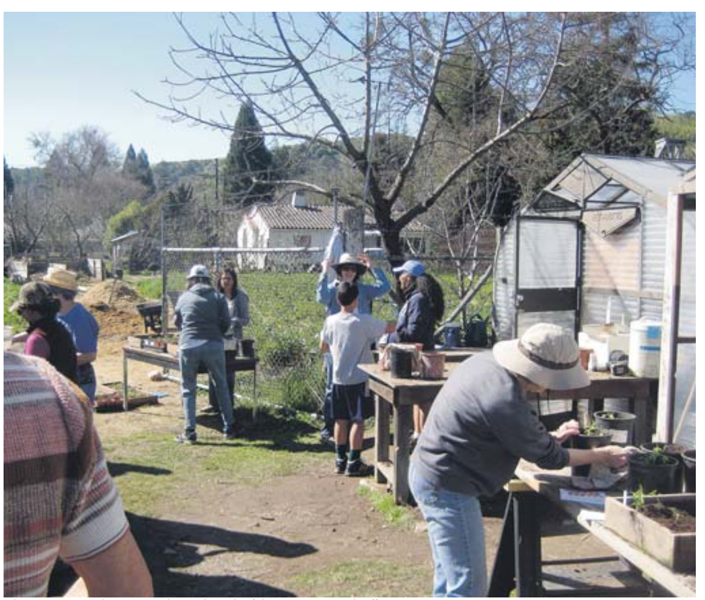
The Moraga Garden Farm is located south of the Moraga Ranch off Moraga Way

The next step is the building of fourfoot-wide raised beds separated by twofoot-wide pathways.