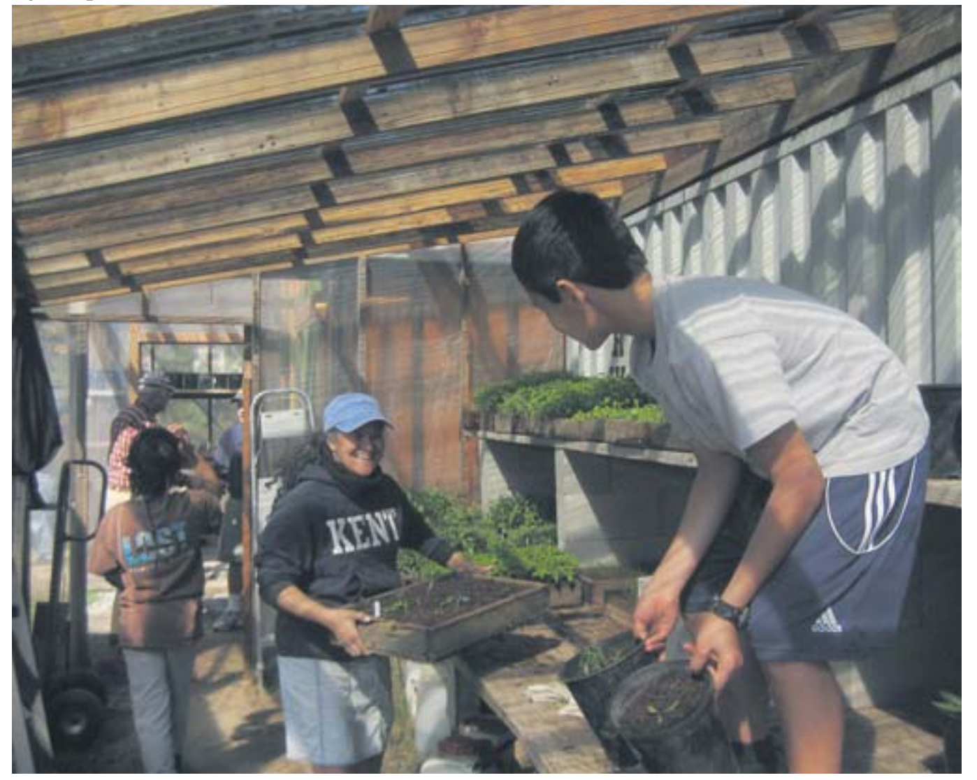
Volunteers of all ages spend their Saturday morning working at the Garden Farm