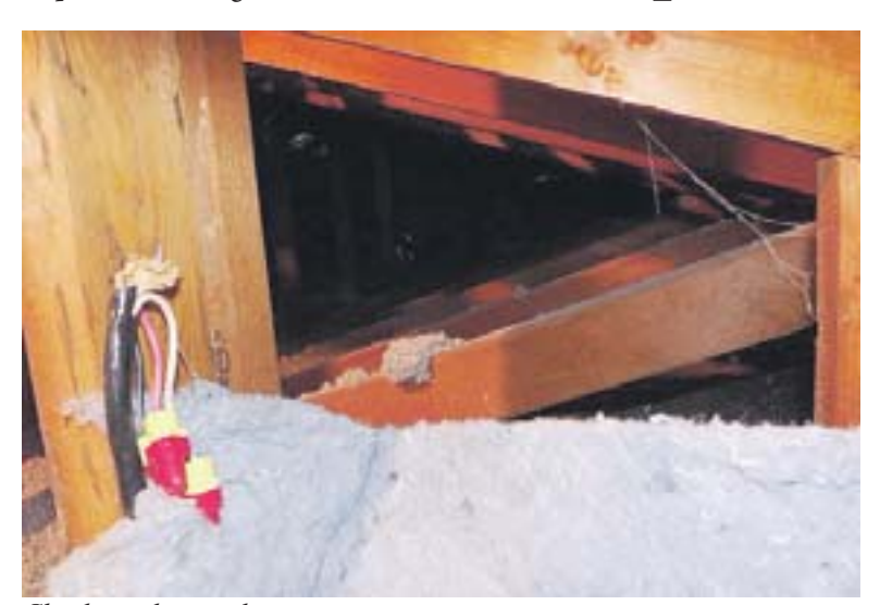
Check on electrical wires

Pacific Gas and Electric offers a 15-cent per square foot energy rebate to residential customers on some insulation upgrades through Dec. 31. Go to www.pge.com/rebates for details. The DOE website http://www.ornl.gov/~roofs/Zip/ZipHome.html offers insulation guidelines by zip code (although the Lamorinda area zip codes entered default to Napa, Calif.). A full fact sheet is available online at http://www.ornl.gov/sci/roofs+walls/insulation/ins_01.html.