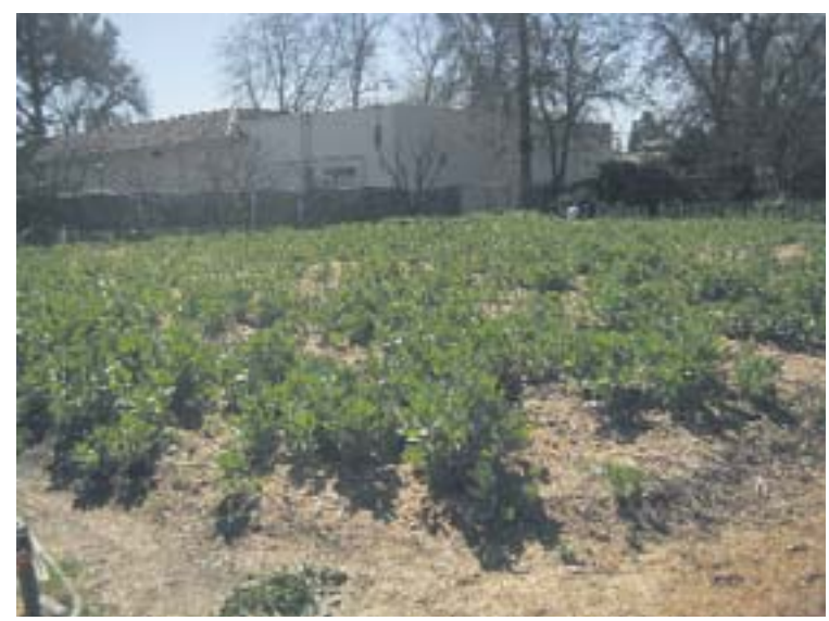
Fava beans help the soil

"In the fall, we plant a cover crop of nitrogen-fixing legumes such as fava beans, bell beans and purple vetch," he said. When the plants have matured and the soil is still moist, but not too heavy, the entire cover crop is tilled into the ground. ... continud on page D6