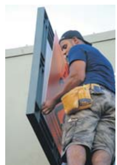
Table 24 opened in September 2010

he past five years have been quite tough for many retail businesses. Lamorinda, like the rest of the state and the country, has suffered the hardship of the recession.