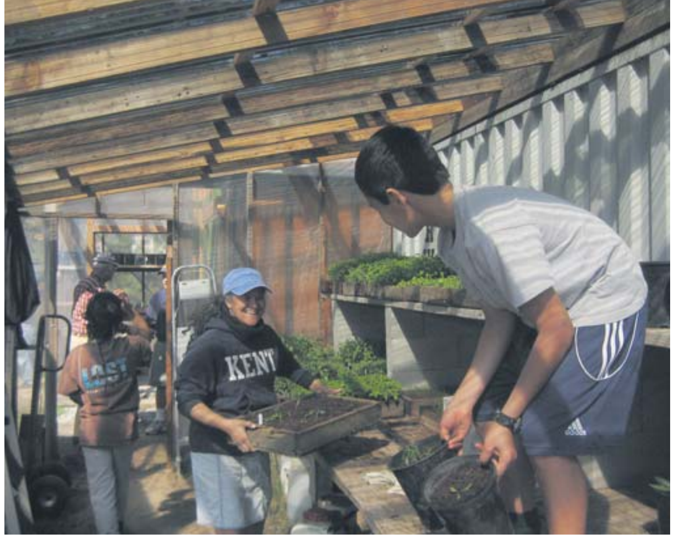
Volunteers of all ages spend their Saturday morning working at the Garden Farm