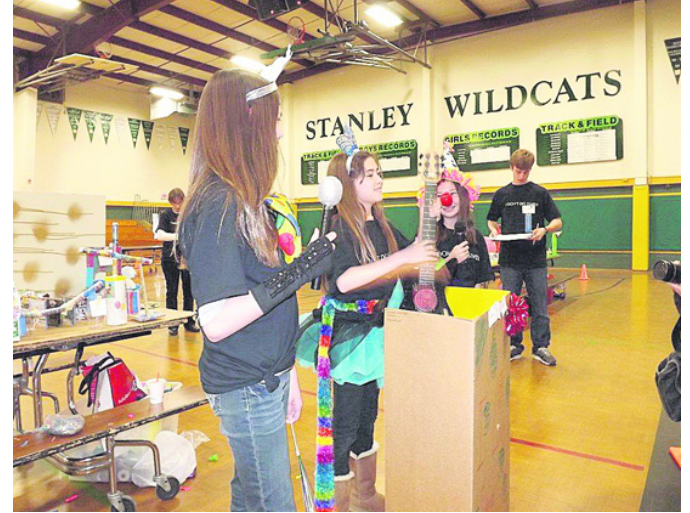
The winners of third place