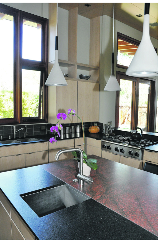
Sink in island

Visit www.lafayettejuniors.org for more information.