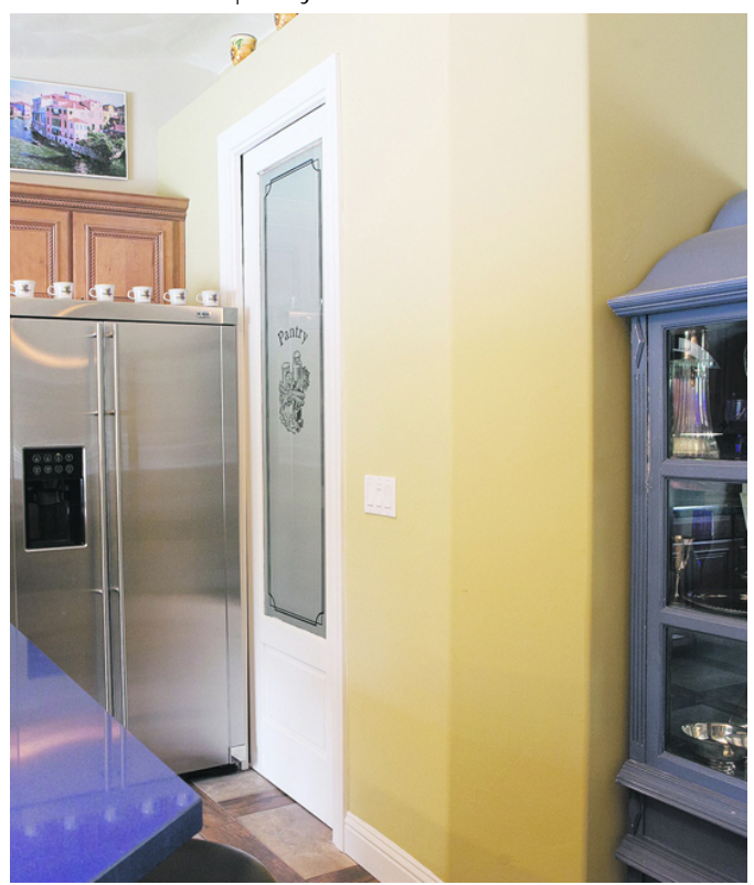
Walk-in pantry

Reach the reporter at: <a href="mailto:info@lamorindaweekly.com">info@lamorindaweekly.com</a>