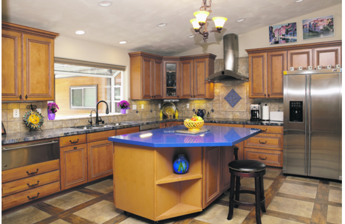
Mobile island in Timberly Scott's kitchen