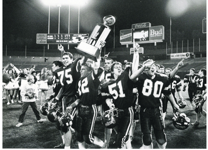
1986 team Photos provided

Reach the reporter at: <a href="mailto:info@lamorindaweekly.com">info@lamorindaweekly.com</a>