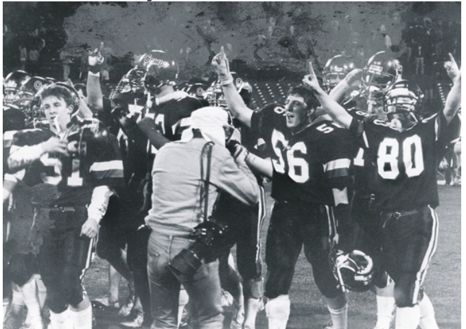
1986 team Photos provided