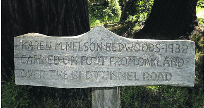
Sign by the redwood trees in Nelson's back yard

You can read more about life in the Old Yellow House online at https://www.lamorindaweekly.com/archive/issue0607/Growing-up-in-The-Old-Yellow-House.html