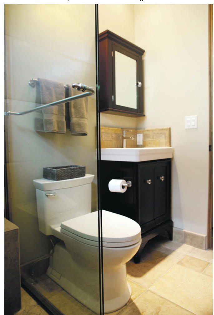
Bathroom with deep brown patina cabinet

Reach the reporter at: <a href="mailto:sophie@lamorindaweekly.com">sophie@lamorindaweekly.com</a>