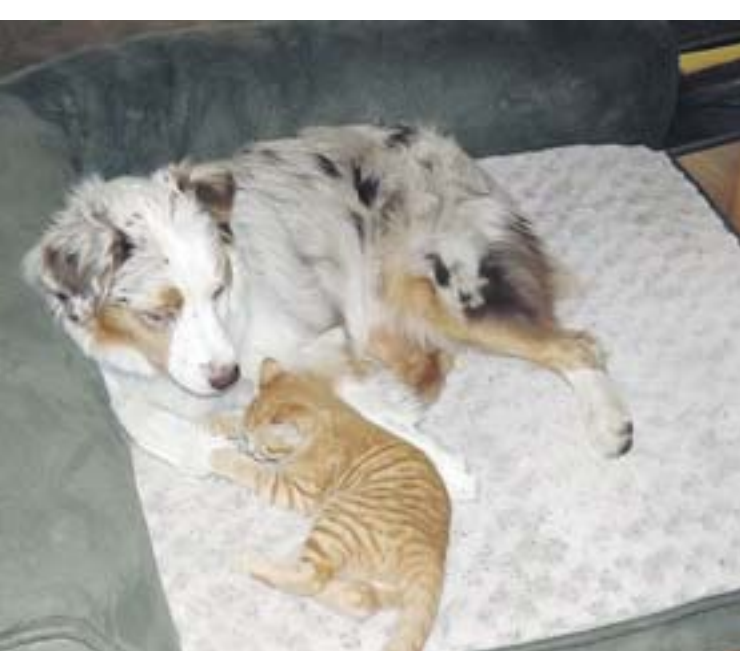
Australian Shepherd Guinevere snuggles with Hobbes