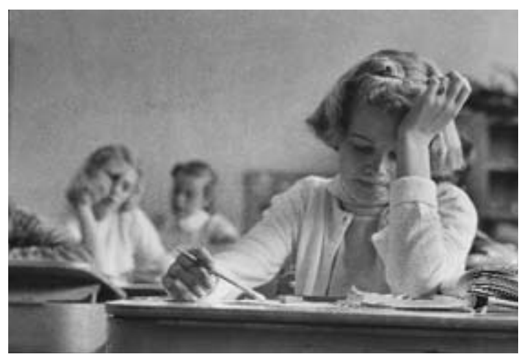
"Resignation," responded Miller when asked to describe this math test moment experienced at some point by every student, everywhere.

All photos copyright, Wayne F. Miller, 1958. Used with permission.