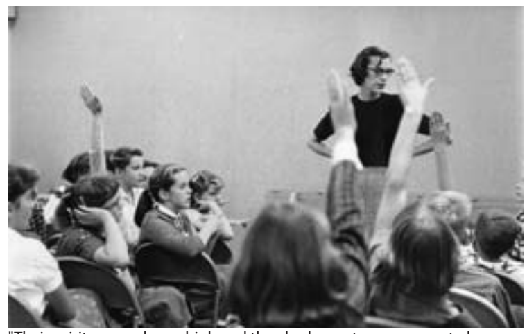
Their spirits were always high and they had an extra eagerness to learn. The class had more than its share of leaders in all fields - scholastic, athletic and social. It made me feel good just to be with them," wrote Miller.