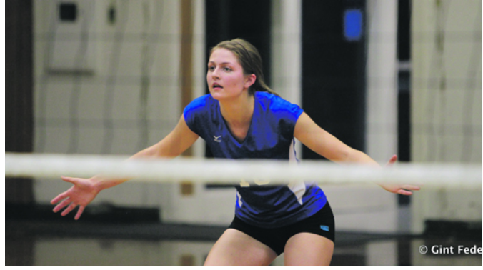
Brooke Aiello

Reach the reporter at: <a href="mailto:sportsdesk@lamorindaweekly.com">sportsdesk@lamorindaweekly.com</a>