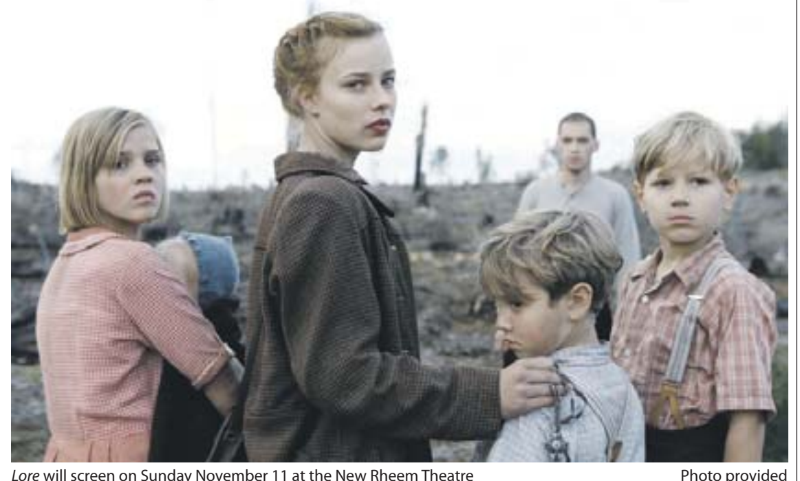
Lore will screen on Sunday November 11 at the New Rheem Theatre

witter has been buzzing for weeks regarding plans to celebrate the 15th anniversary of the California Independent Film Festival. This year's lineup includes programs for children, as well as another dazzling array of touching and thoughtprovoking films for adults.