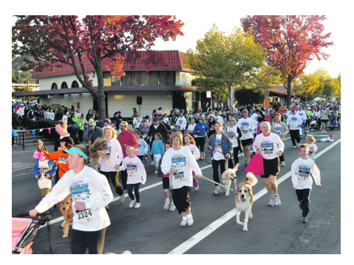
Last year's 2K run

Now in its 20th year, Lafayette's famous exercise-based moveable block party will be back in action this coming Sunday, October 28. This year's theme is all about the alleged alligator spotted more than three decades ago in the reservoir.