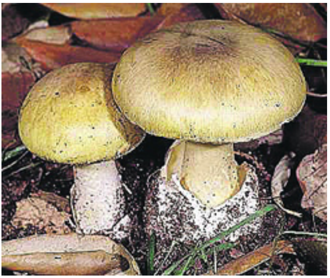
Death cap

Useful websites for mushroom identification and photos can be found at http://bayareamushrooms.org/poisonings and http://namyco.org/toxicology (North American Mycological Association).