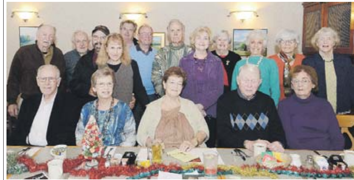
Former Laf-Frantics members gather for their annual holiday brunch at Terzetto in Moraga.