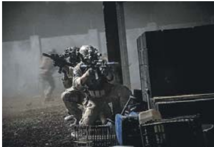
Zero Dark Thirty