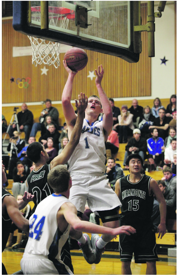
file:///C|/Documents%20and%20Settings/Andy/My%20...sue0623/pdf/Miramonte-Splits-Rivalry-Series.html (2 of 3) [1/15/2013 8:53:29 AM]