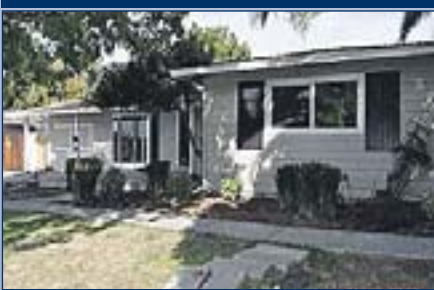
Duplex- representing Buyer- Orinda