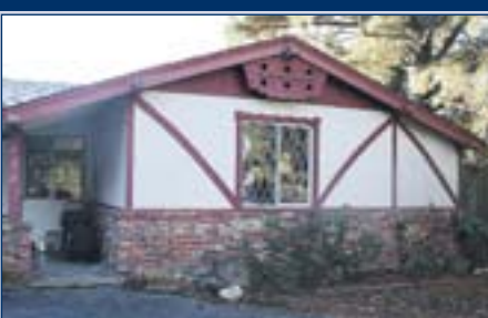
Sale Pending, Representing Seller, Sold before going on MLS