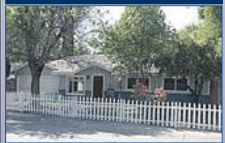
Sale Pending- representing Buyer-Orinda investor