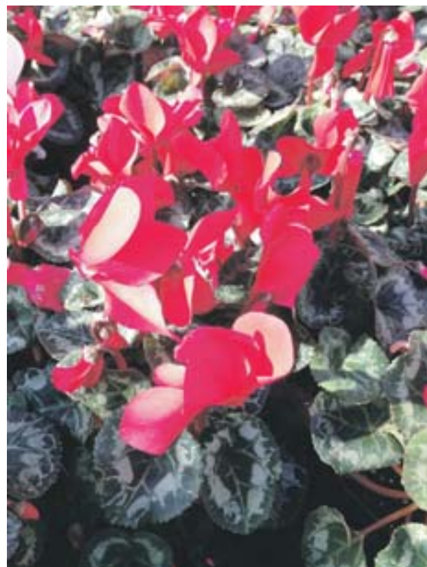
A flat of red cyclamen sparks a flame in every garden.