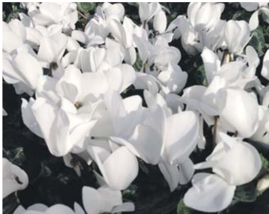
Add a splash of white to brighten the night skies.

A dull lackluster winter garden turns into second chances and new romances with a little imagination, ingenuity, and a shovel of soil. Lift your spirits and steep your landscape with love potion frivolity. Happy Valentine's Day!