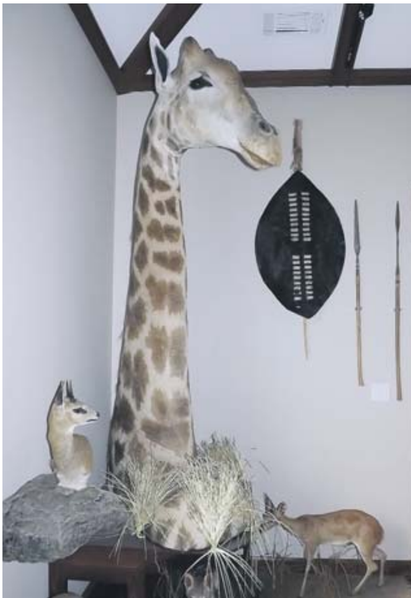
Displays create a museum-like atmosphere in expansive Lamorinda trophy room.