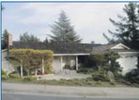
24 Corte Mateo, Moraga

Single-story on cul-de-sac. High-end updates throughout. 3 bedrooms + office, 2 baths, amazing kitchen open to family room. Hardwood flooring, dual-paned windows, top-of-the-line appliances, huge master retreat. Private yard with pool, patio, built-in BBQ and views.