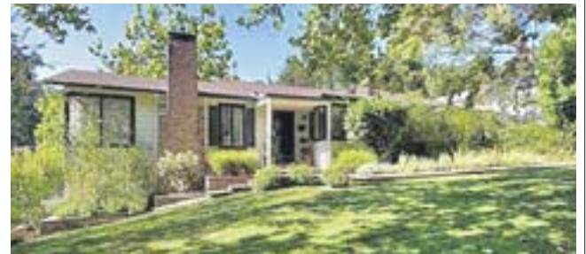
11 El Verano, Orinda