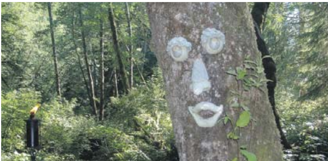
Smile and the world smiles with you...even trees.