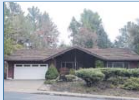
343 Calle La Mesa, Moraga

Pristinely maintained rancher. Kitchen open to family room and dinette. Gracious living and formal dining rooms. Hardwood flooring, dual-paned windows. Private yard with patio, lawn and hillside.