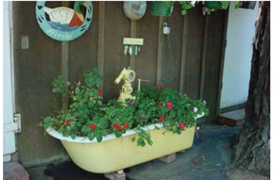
Claw foot tub becomes a container garden.