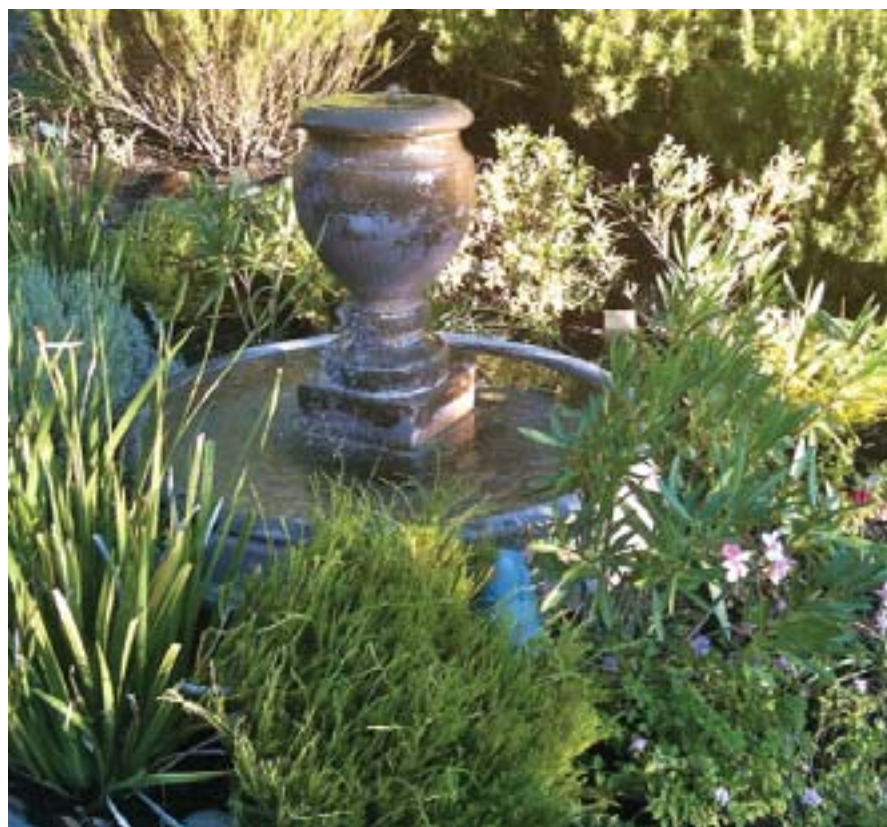
A water feature is a must for every romantic interlude.