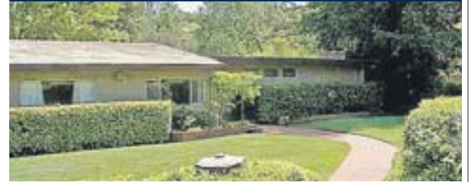
3949 Rancho Road, Lafayette