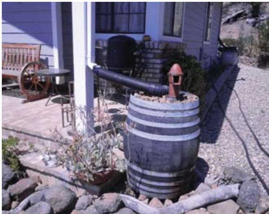
Wine barrel is converted to save rain run off.