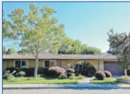
3980 Paseo Grande, Moraga

Four bedrooms, 2.5 baths, single-story home. Granite kitchen, large living, dining and family rooms. Hardwood flooring, dual-paned windows, updated baths. Yard with garden and patio.