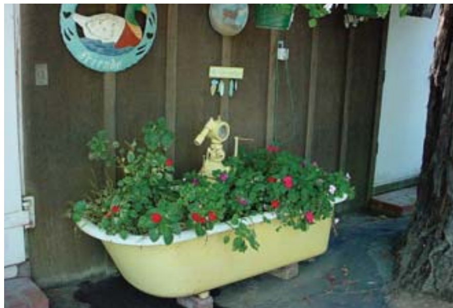
Claw foot tub becomes a container garden.