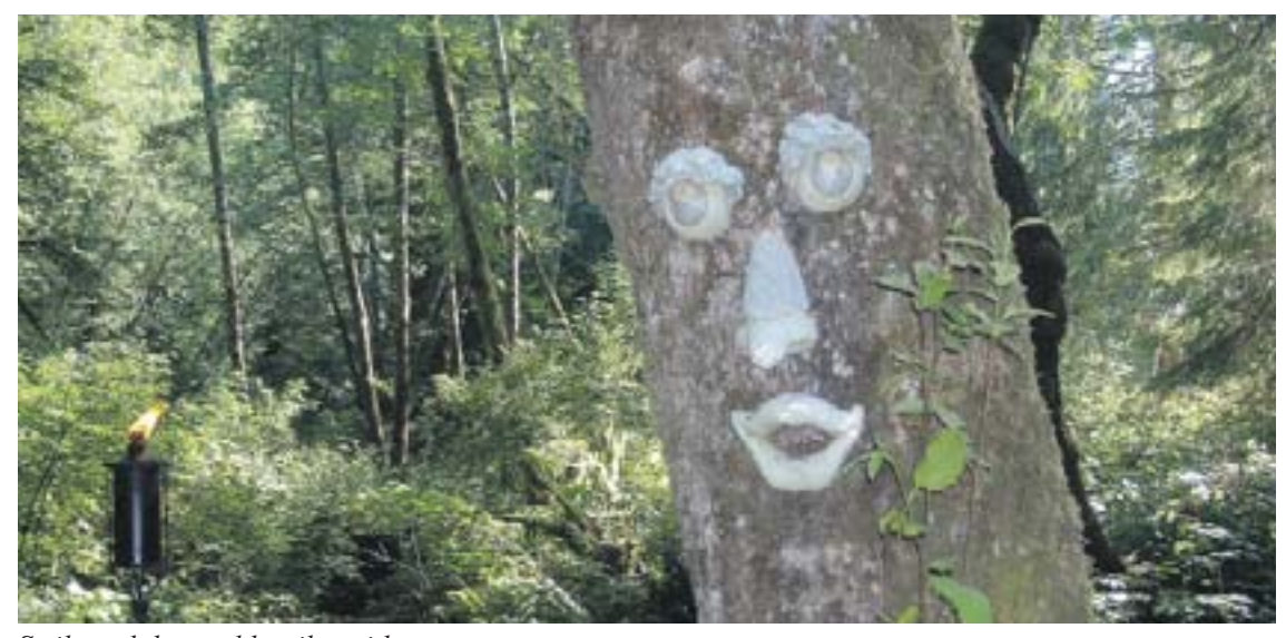
Smile and the world smiles with you...even trees.