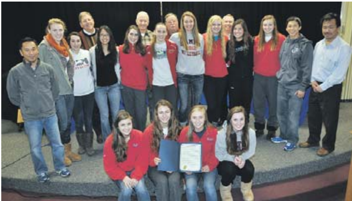
Girls varsity volleyball team

High School boys' varsity cross country team and winner of the 2012 North Coast Section Division III Individual Championship; and the Campolindo girls' varsity volleyball team that competed in the CIF Division III State Championship game—