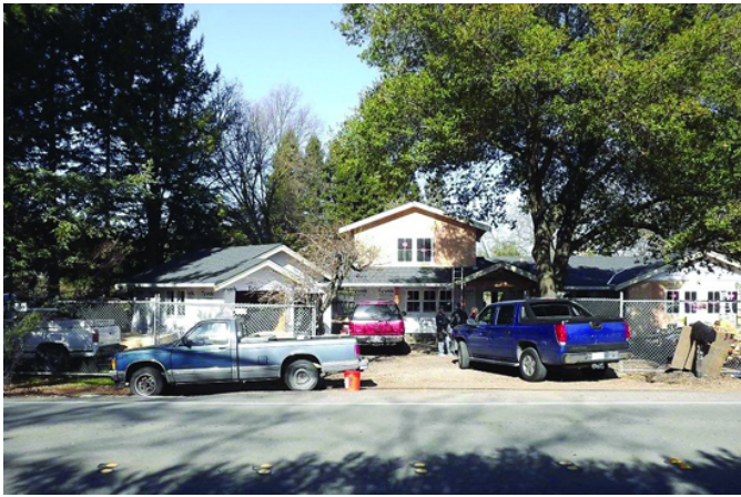
663 Glenside Drive, Lafayette