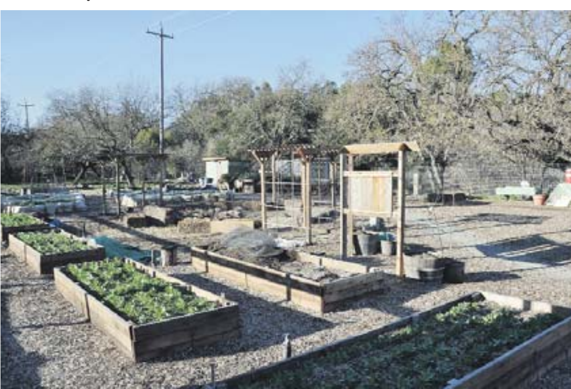
Community Garden on Mt. Diablo Blvd.