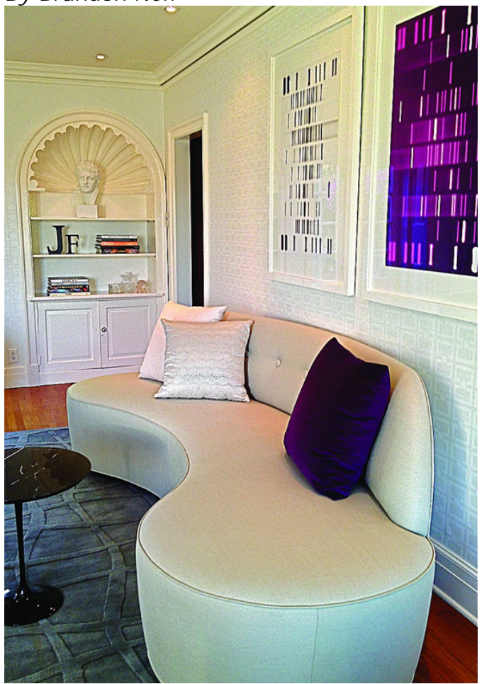
A curvy custom sofa and plush pillows add comfort and glamour.

Believe me, holiday themed articles peppered with witty, cutesy turns-of-phrase and double entendre are not my style. You'll never read my "Deck The Halls With Boughs Of Velvet," or my "Jack-O-Lantern Decorating Extravaganza" in this column. In fact, I would say that I go to great lengths to avoid any type of contrived prose or display altogether. However, how can I ignore that Valentine's Day is upon us, and begging to be recognized? I'm no cynic (well, maybe a little). So, in honor of the occasion I will do my best to thread the needle of incorporating something resembling romance into this week's feature without dissolving into saccharine rhetoric. Don't expect any "love nest" or "supersexy boudoir" recommendations from me here, but rather, I offer you a more esoteric take on the occasion - glamour.