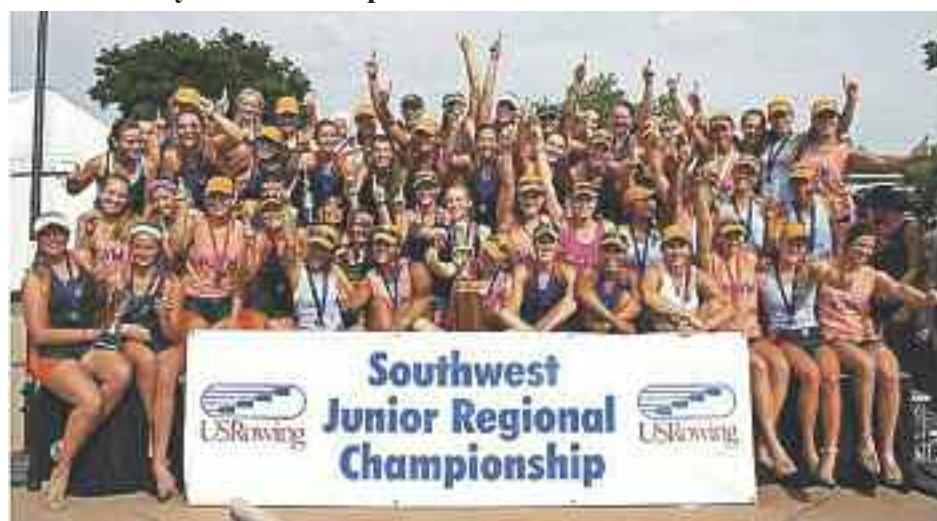
Oakland Strokes team members celebrating with newly acquired hardware