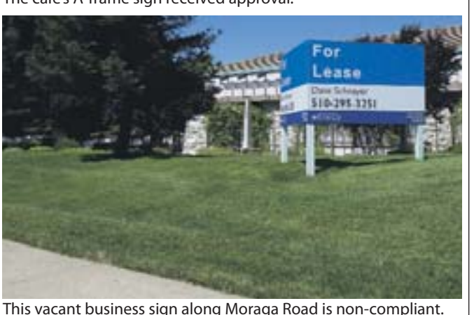
This vacant business sign along Moraga Road is non-compliant.