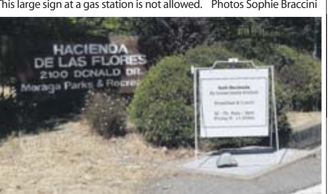
The café's A-frame sign received approval.