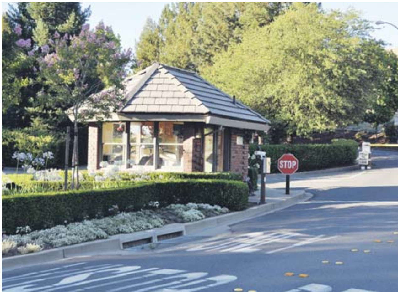
The entrance to this gated neighborhood in Lamorinda includes a security camera.