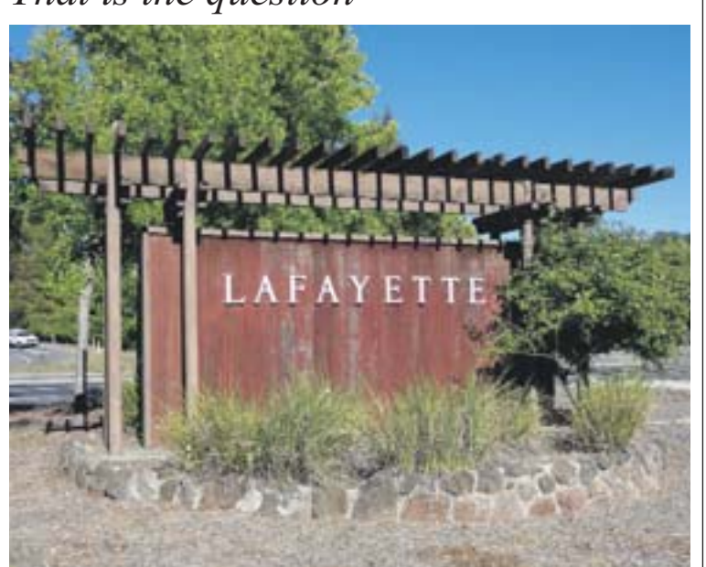
Dated sign at the base of the Highway 24 off-ramp at the Acalanes Road exit.

Lafayette. Stakeholders, especially in the Acalanes area on the west edge the city, describing them as "stark" the need for repairs, are concerned are meeting to discuss the matter scape committee of the Acalanes C. Tyson