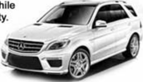
Only Diamond Certified auto repair facility in the whole Lamorinda area.

Use a local company that supports our community!