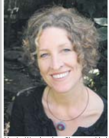
Monica Wesolowska

A poignant memoir about the tragic task of letting go By Lou Fancher