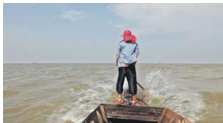
"A River Changes Course"

Information and tickets are available at caiff.org, or at the Rheem and Orinda theaters, for members only until Oct. 13, then afterward to the general public.