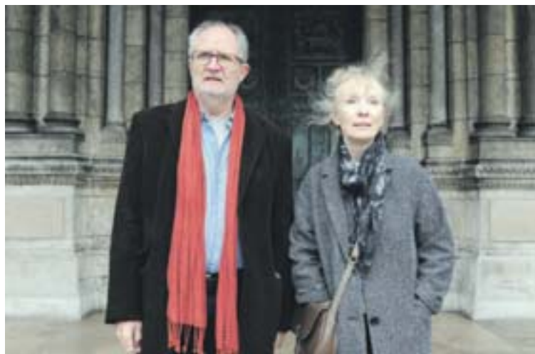
Opening night movie "Le Week-End"